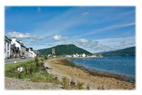
Figure 1 A photograph of the buildings at the front of Inveraray on a sunny day.

their first meeting in Inveraray which the CEO attended. The CEO had the opportunity to lobby the Cabinet Secretary for Health and Social Care about the importance of working directly with third sector organisations as well as highlighting the success of the Community Mental Health and Wellbeing (CMHWB) Fund and the importance of three year funding and full cost recovery.